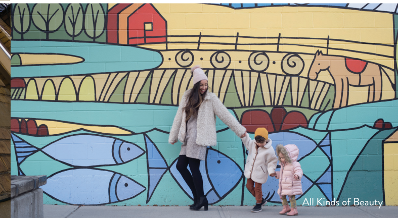
All Kinds of Beauty