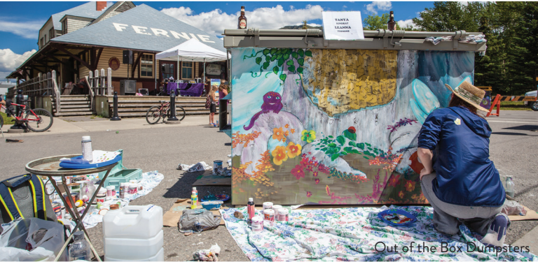
Out of the Box Dumpsters