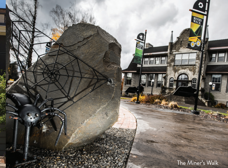
The Miner's Walk