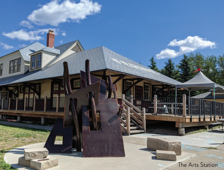
The Arts Station