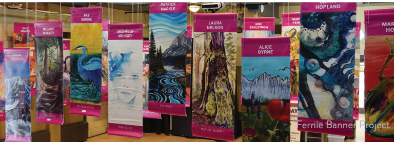
Fernie Banner Project

The Fernie Banner Project launched in 2005. Each year, colourful new banners by local artists are produced to line the streets in Historic Downtown Fernie and then spend their second year along Hwy #3. In 2014, the Out of the Box Dumpster project was created to bring art to unlikely places. Locations are constantly changing and can be found all around Fernie. For more information visit theartsstation.com