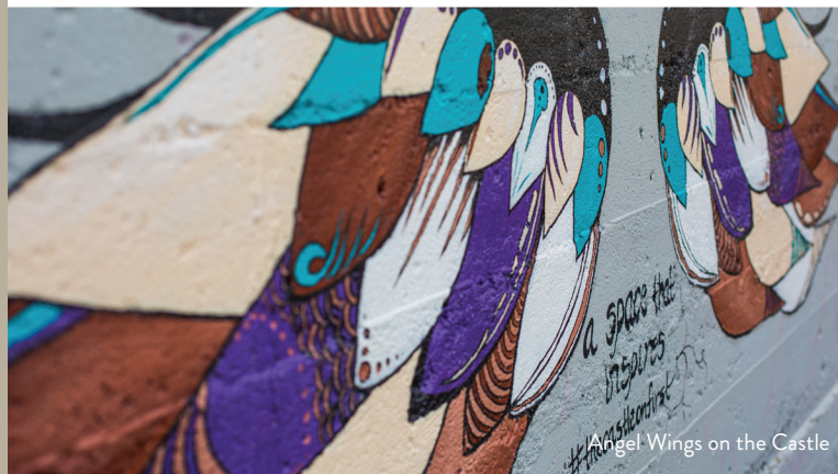
Angel Wings on the Castle