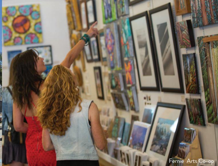
Fernie Arts Co-op