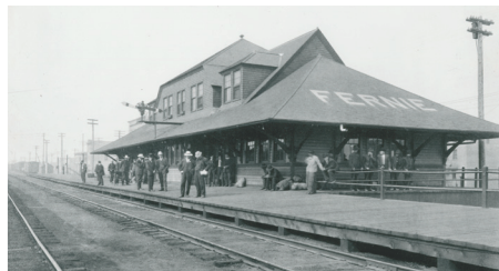
1 CPR STATION 601 1st Avenue

The former Canadian Pacific Railway (CPR) Station. Passenger service was discontinued in 1964. Built in 1909, it is now home to the Fernie & District Arts Council.