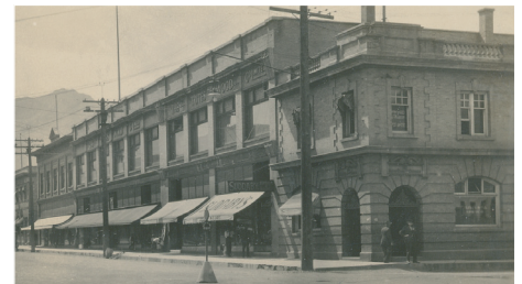
3 THE HOME BANK 491 2nd Avenue

A highly decorative building built in 1910 to house a branch of the Home Bank and the Herchmer-Mitchel Law Office, it is now home to the Fernie Museum & Visitor Centre.