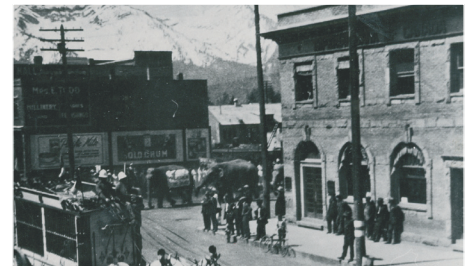
4 THE IMPERIAL BANK 1909 401 2nd Ave

Rebuilt in 1909 and home to the Imperial Bank of Canada. Location of the Fernie Fire Department’s last stand against the 1908 fire. Now home to The Brickhouse Bar & Grill.